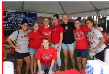
LLS Volunteers -Barry University Softball Team

www.lightthenight.org/sfl/localchapter/volunteer or call us! (954) 744-5311