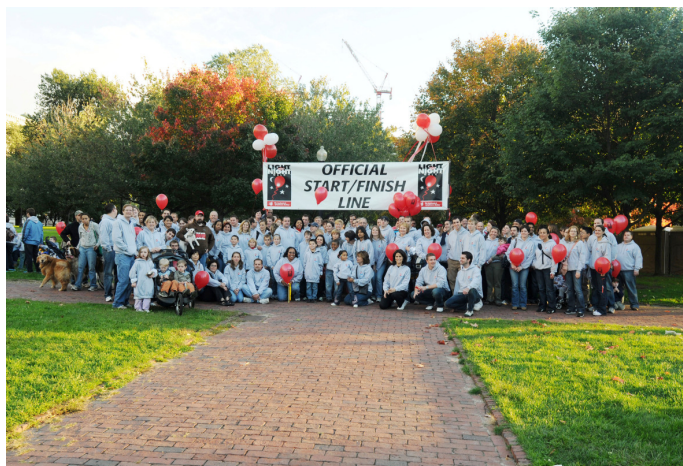
Above: 2008 Millennium: The Takeda Oncology Company Walk Team